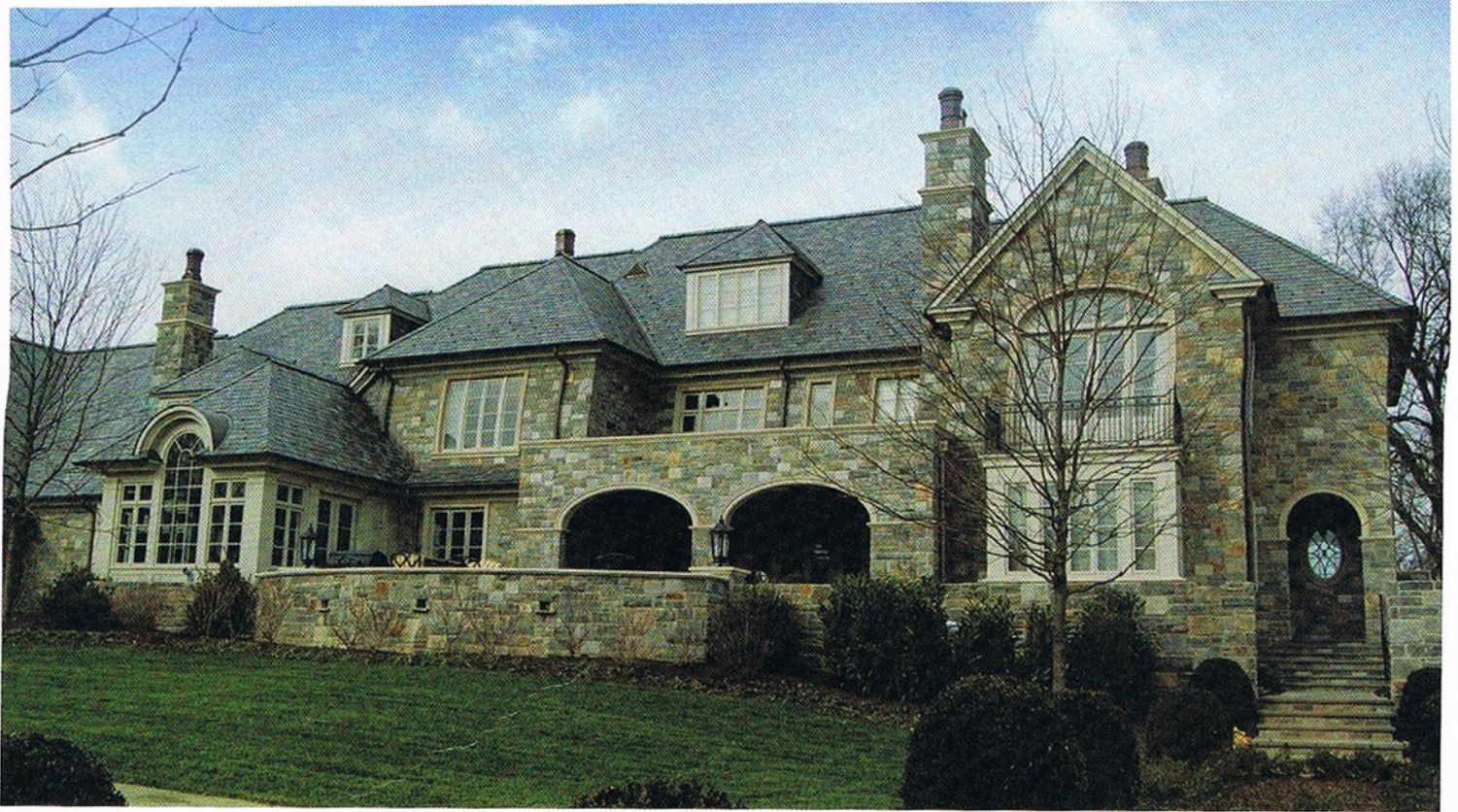
Gillespie's company has installed slate roofs on homes up to 20,000 square feet and is scheduled to start a very large slate roof in Merion Station this fall.