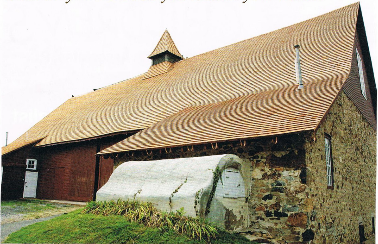
Gillespie recently completed a major barn roof at the Springton Farm in Glenmoore. According to Gillespie, traditional cedar roofs last 30 to 40 years and come in 100 different styles – and he's worked with them all.

What do you see when you look at your house?